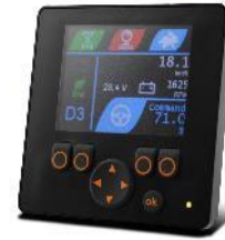
New SD-DISPLAY-CR0451 P/N B56556X