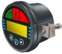
Display P/N A47449A

Poclain Hydraulics improves continuously its product ranges and is replacing its 1,5" and 4,3" electronic display.