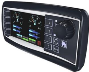
Display P/N A48371C