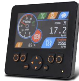
New SD-DISPLAY-CR0452 P/N B50721F